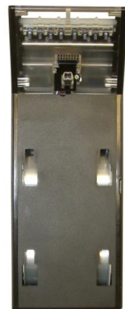
Payout Module Front View

Validated bank notes can be stored in the NV200's secure cashbox or travel into the payout module if needed for future payouts. The SMART Payout unit works with any SMART Payout currency dataset created by Innovative Technology Ltd.