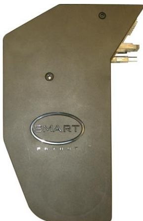
Payout Module Side View

The SMART Payout unit is a device that can validate, store and later dispense up to 70 bank notes of mixed denominations.