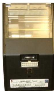
Payout Module Top View